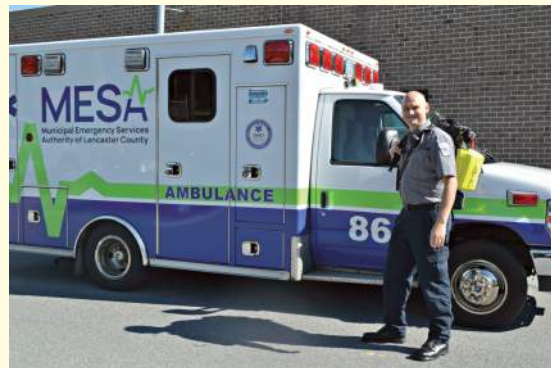
MESA is actively seeking full-time paramedics and part-time EMTs! Visit mesalancasterpa.gov for information and to apply.

For more information about career opportunities, visit mesalancasterpa.gov .