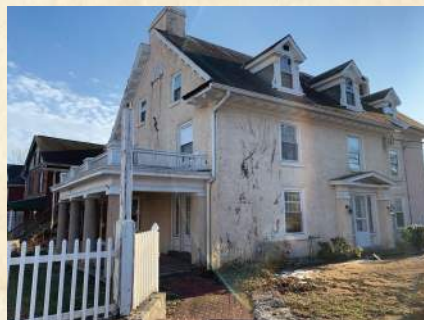
Black Bear Tavern built in 1745, rebuilt in 1915, located at 56 N Market Street in Elizabethtown and owned by the Borough.

Post Script: Elizabethtown was not incorporated into a borough until 1827. So while the town was being birthed, it was on Donegal Township land.