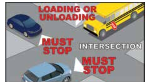
You MUST STOP at an intersection, whether it is or is not marked with a stop sign. All traffic MUST STOP .