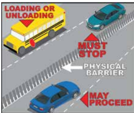
Physical barriers include concrete median barriers, metal median barriers, guide rails, etc.