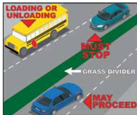
Clearly indicated dividing sections include trees or shrubs, rocks or boulders, a stream, grass, etc.