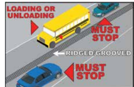
You MUST STOP on roadways with ridged/grooved dividers.