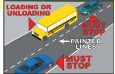
You MUST STOP on roadways with painted lines.