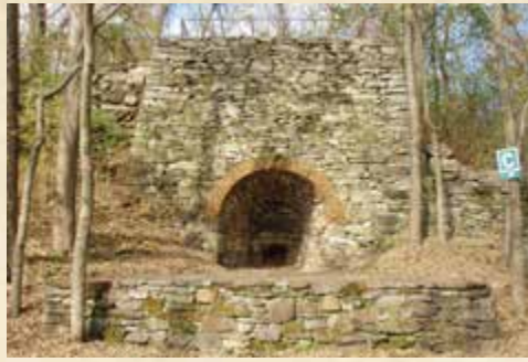
Lime kilns were loaded with limestone rocks and fuel. The resulting heat transformed the stone into lime powder which was then spread on the fields.

While this building was going on he established various enterprises to insure the success of his town. He developed a coal yard, gristmill, stone quarry, limekilns, and a large agricultural implement business. Scores of new residents came. This little town, situated next to the Pennsylvania Railroad and the Harrisburg-Lancaster Turnpike, began attracting investors.